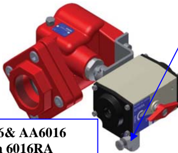
6016 & AA6016 with 6016RA