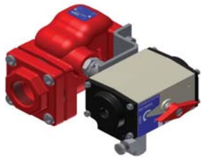
6010 & AA6010 with 6016RA